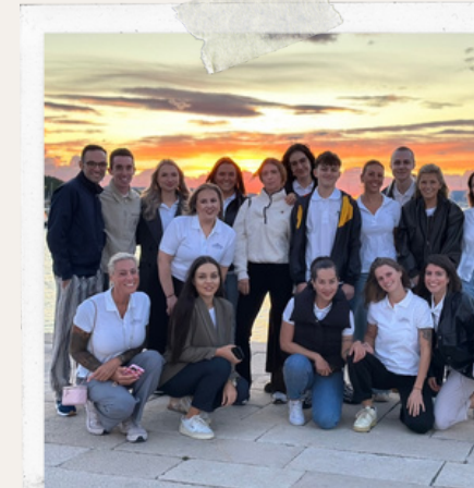
WhatsApp Crew Groups

Yachtie Careers Discover your full potential